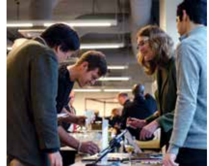
Here, opening reception attendees interact with some of the exciting research projects underway

These projects are representative of the collaborative efforts that the Center aims to facilitate. The Kinect project brings together faculty from the Antoinette Westphal College of Media Arts and Design, the School of Biomedical Engineering, Science and Healthy Systems and the College of Nursing and Health Professions. The virtual opera research unites Drexel faculty with partners from the Opera Company of Philadelphia and The Curtis Institute of Music. "Sonic City" brings together Drexel's Colleges of Engineering, Arts & Sciences, and Media Arts & Design with the non-profit Breadboard and the geospatial software company Azavea. ■